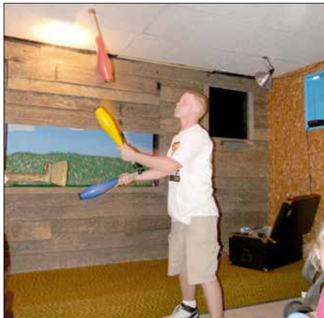
A little juggling