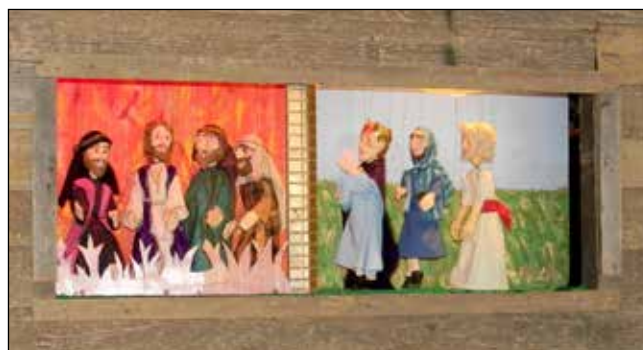
The fiery furnace